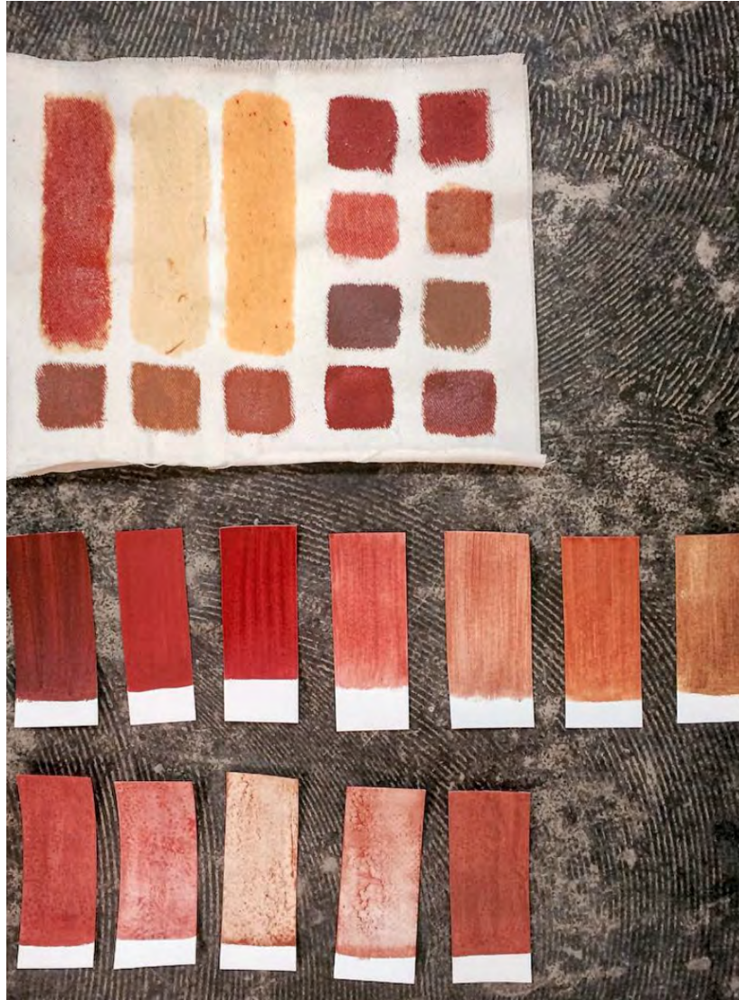
Colour palette made with paper and fabric swatches. Photo of the Paris workshop.