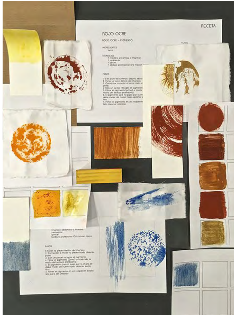
Colour swatches. Creating a beautiful moodboard. Participants will make a moodboard using all the sampling developed during the workshop. Photo of the Barcelona workshop.