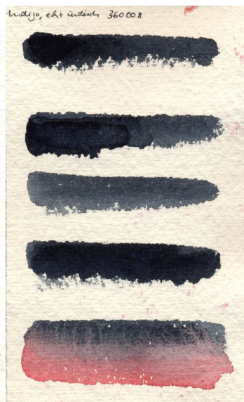
Cotton Rag Paper