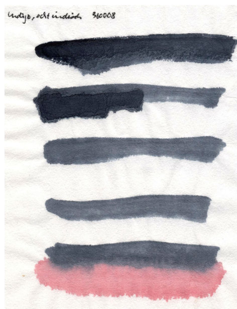
Chinese Rice Paper