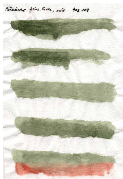
Chinese Rice Paper